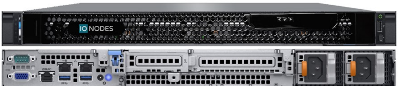
Single processor version

The CR6 series of video servers is designed, tested and certified to run the latest industry-leading video management software solutions. With capacities ranging from terabytes to petabytes, and high performance video throughputs, rest assured that the CR6 line of servers will meet the most demanding requirements.